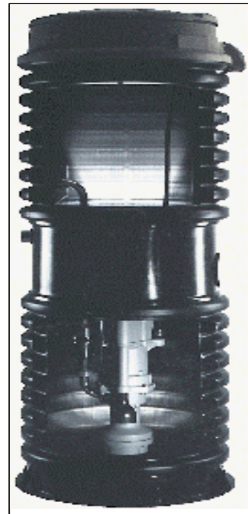
Cutaway view of E-1 Model 2010 grinder pump